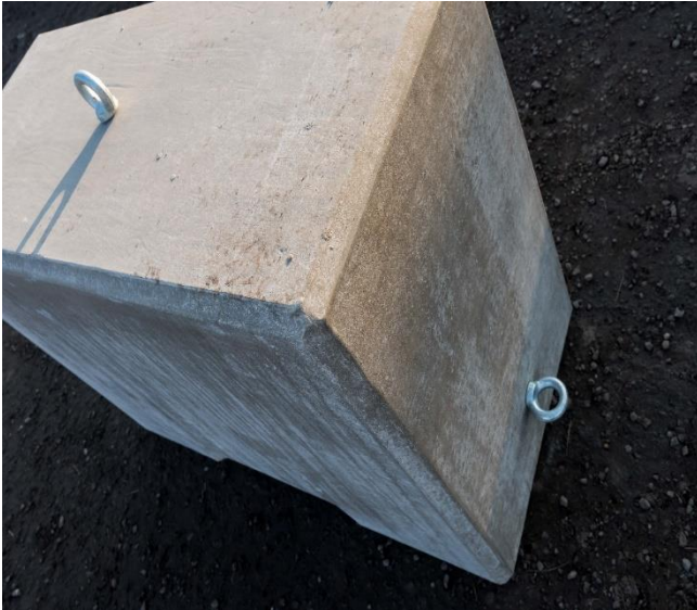
Figure 1 Concrete blocks – with appropriate fixing point & weighing a minimum of 163kg