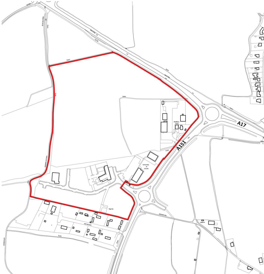
Figure 1 Location Plan

4.1. The site lies to the south west of the A151/A17 junction, known as Peppermint Junction to the west of Holbeach.