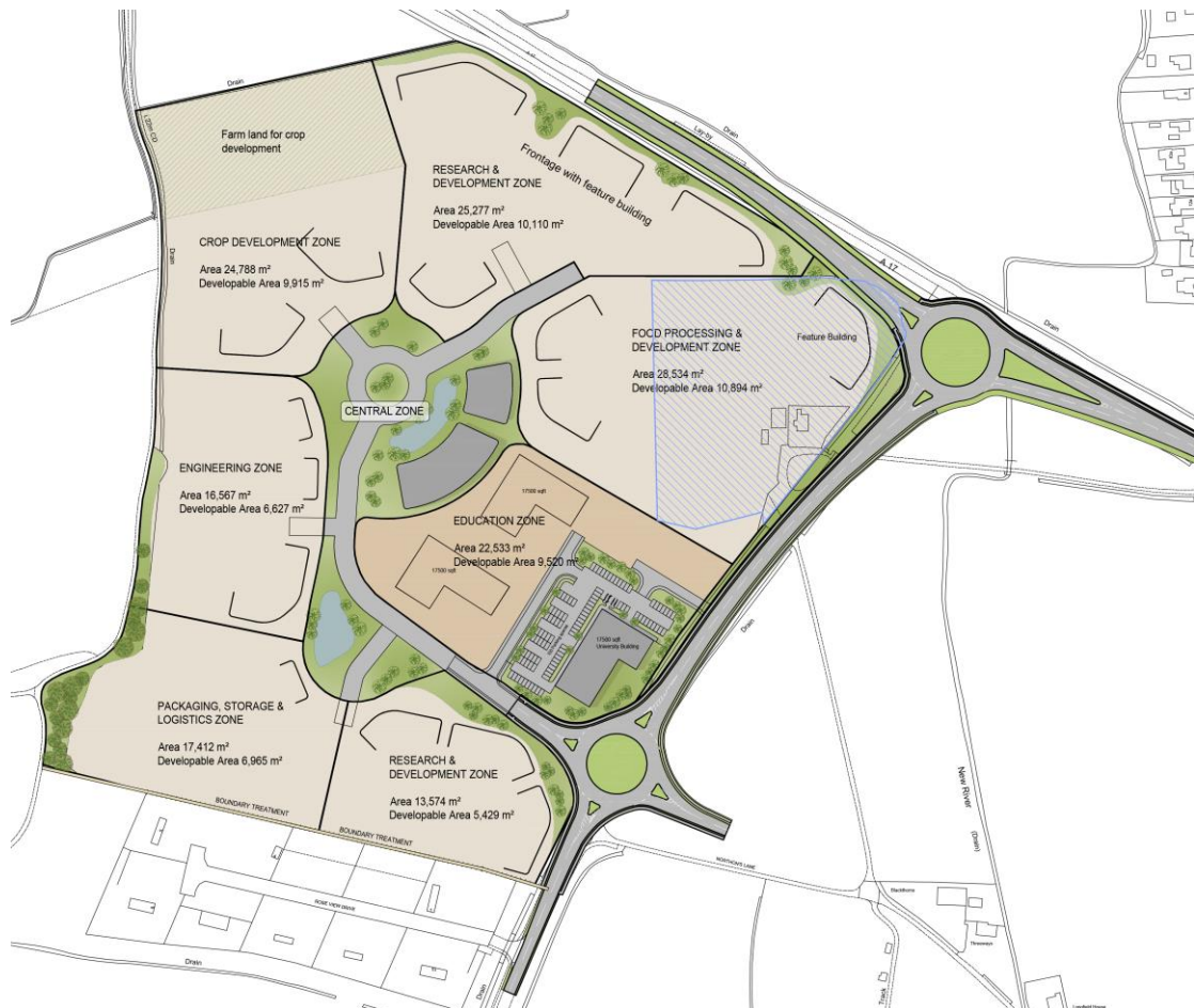
Figure 2 Composite plan showing SLFEZ site, proposed residential development, Peppermint Junction improvements and University of Lincoln scheme