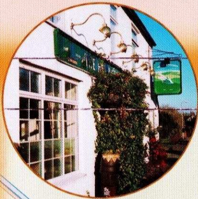
The Hat & Feathers Pub

The route is waymarked with Millennium Trails Waymarkers, yellow on the main route, orange on the short cut.